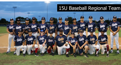
15U Baseball Regional Team

Check out our full recap of the Regional, including video highlights at www.rbiaustin.org/2021-regional-recap .