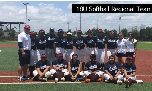
18U Softball Regional Team